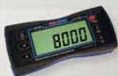
MSI-8000 RF Remote Display