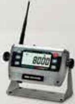
MSI-8000 HD RF Remote Display